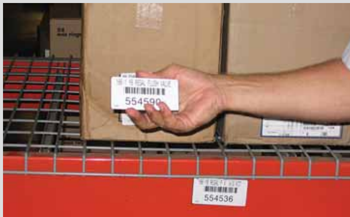
Removable bar codes on magnetic plates make warehousing easier.

People like John Robertson come along maybe once a century and it's