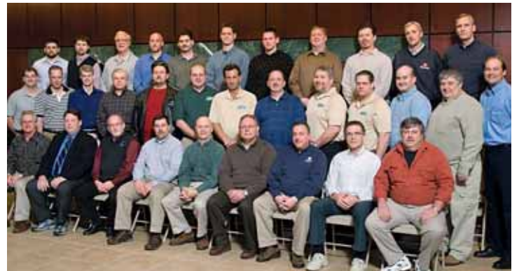
Robertson's branch managers. Small rural markets characterize the company's trading area, leading to many branches.