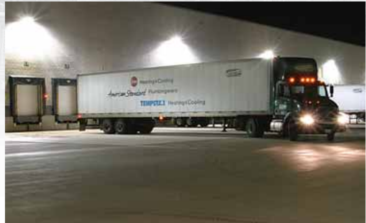
A view inside the company's 285,000-sq.-ft. DC; trucks shuttle goods to branches in the wee hours to assure early arrival for contractors the next day.

that we send out with statements as continuous reminders.