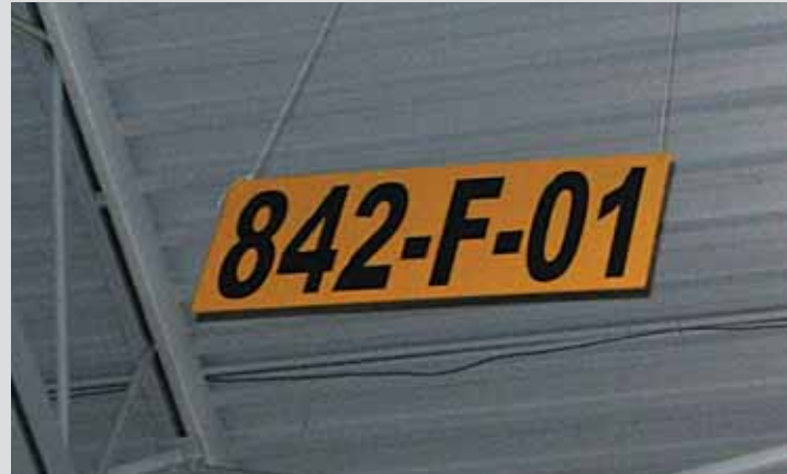
Aisle markers placed up high are easier to read and last longer.