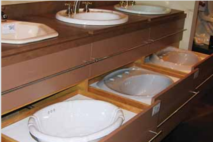
Robertson showrooms utilize pullout drawers as a space saver to display lavs.

unlikely anyone will have as much an impact on the industry as a whole for a long time. Closer to home, though, he appears to have passed along at least some of his genes for innovation. Robertson Heating Supply today is a storehouse of unique ideas and business practices. Many of them were incorporated into the company's 285,000-sq.-ft. headquarters and distribution center in hometown Alliance, OH. Here are some of its distinguishing features: