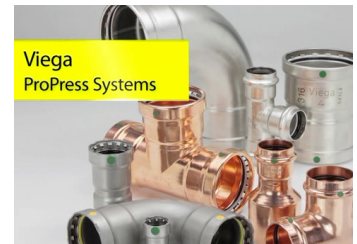
Viega ProPress Systems