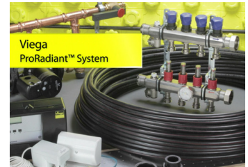
Viega ProRadiant™ System